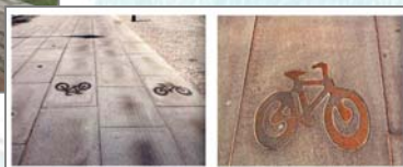
重整梅窩碼頭路及修改停車場 Realigned Mui Wo Ferry Pier Road and Modified Car Park